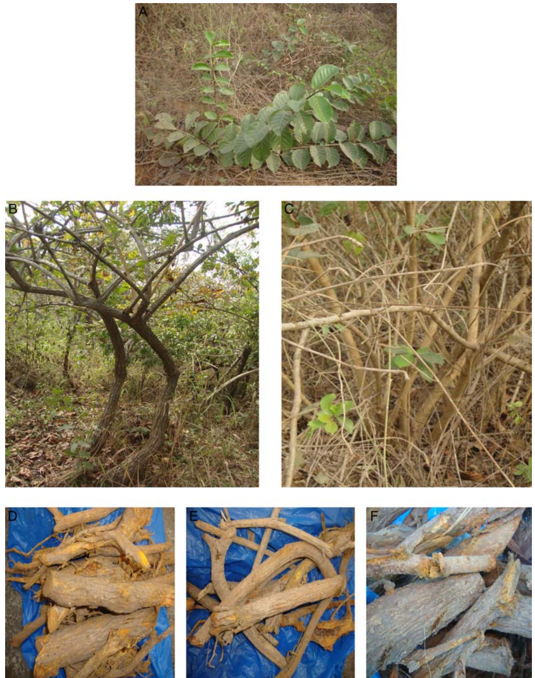
Figure 3. Morphological characteristics of S. latifolius A) Crawling stem, B) arborescent type of stem C) acaulescent type of stem. Colour of root: D) dark yellow, E) light yellow, and F) white.

habitats. This would help explain the competition between other species, search for nutrients and water in lower horizons.. This is in accordance with, findings that show spatial configuration of the root system (number and length of lateral organs) varies greatly depending on the plant species, soil composition and particularly on water and mineral nutrients availability. 35,36 In the field, roots were more linear than in other habitats. This could be explained by 'tilling effect', which might have softened the soil. Our findings suggest that the root system of S. latifolius depends on habitat and development stage. Moreover, the difference in the root biomass, according to the development stage and habitat, is likely due to the ecological conditions, which is not the same as habitat types. Local people harvest the plant irrespective of habitat and development stage for local use and sale in local markets. 37 Following the allometric relations between biomass and plant organs, it would be appropriate to sensitize local populations on the necessity to direct the harvest of the species toward adult individuals in savanna to