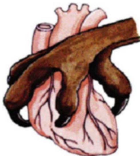
Figure 2. His heart was gripped by a bird's claws.

My heart is firmly seized By a bird's claws;