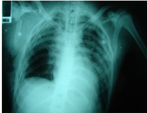
Figure 2. Immediate post-op. chest X-ray.